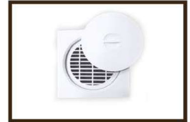
PVC FLOOR TRAP JALI