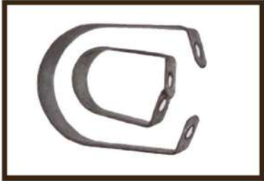
HI TECH CLAMP