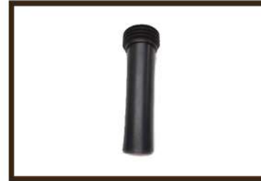
CONCEALED TANK PIPE